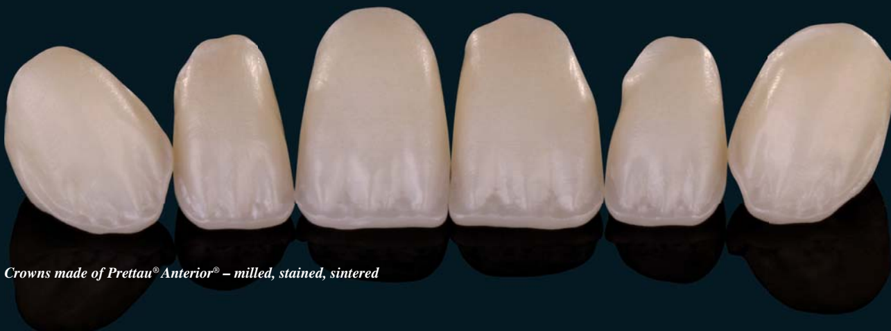
Crowns made of Prettau® Anterior® – milled, stained, sintered