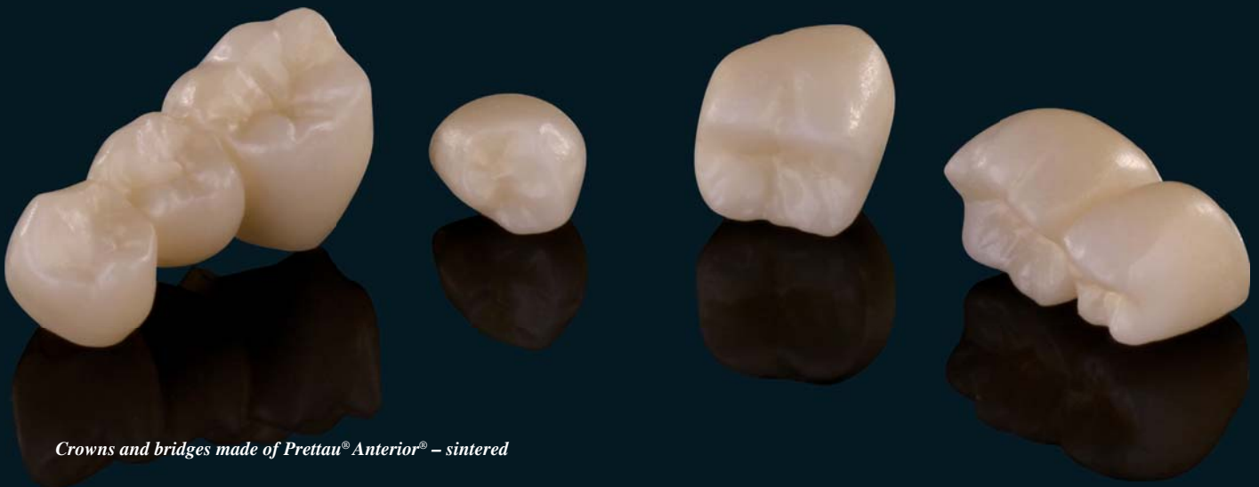
Crowns and bridges made of Prettau® Anterior® – sintered